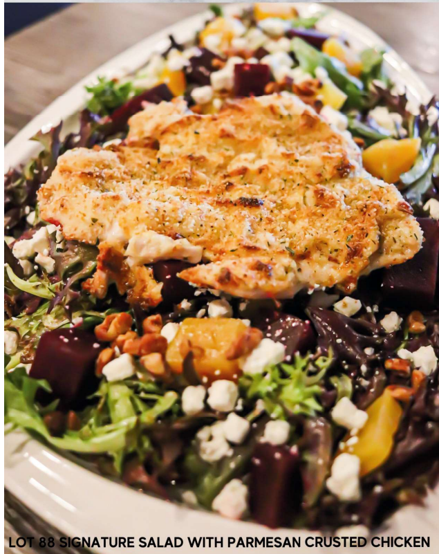
LOT 88 SIGNATURE SALAD WITH PARMESAN CRUSTED CHICKEN