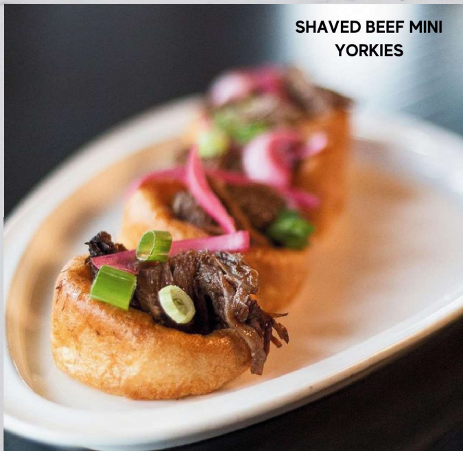
SHAVED BEEF MINI YORKIES