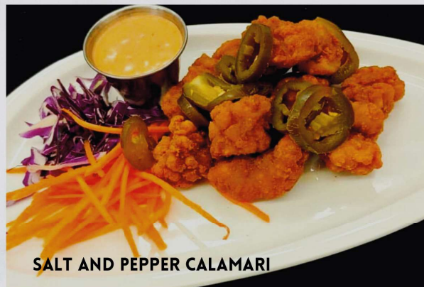
SALT AND PEPPER CALAMARI