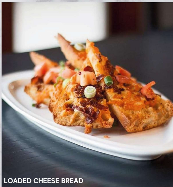
LOADED CHEESE BREAD

yellowfin tuna and mango in sesame ginger sauce with avocado & cucumber served with wonton chips