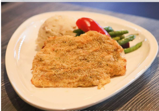
PARMESAN CRUSTED CHICKEN

prime rib patty, egg, aged cheddar applewood smoked bacon, crispy onion strings, ancho aioli & fries