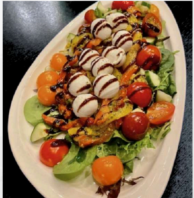
LOT 88 SIGNATURE SALAD WITH PARMESAN CRUSTED CHICKEN