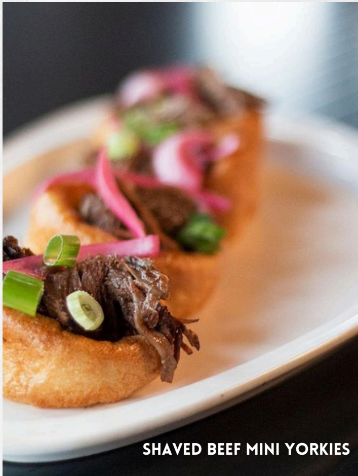
SHAVED BEEF MINI YORKIES