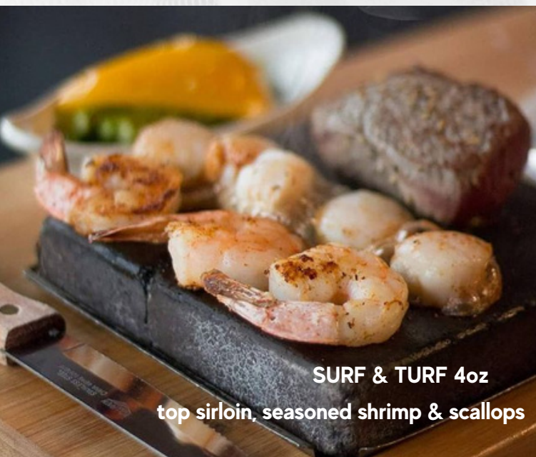
SURF & TURF 4oz top sirloin, seasoned shrimp & scallops